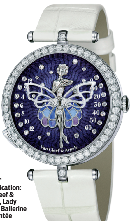
Ladies' Complication: Van Cleef & Arpels, Lady Arpels Ballerine Enchantée

The prestigious international jury of the 13th GPHG brought together the skills of watch experts, collectors and authoritative figures in the watchmaking industry. 15 prizes honoured the year's finest watch creations, including the supreme distinction, the Aiguille d'Or, which was awarded to Girard-Perregaux for the Constant Escapement LM watch.