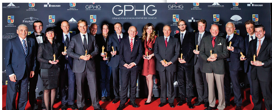
THE JURY AND THE WINNERS