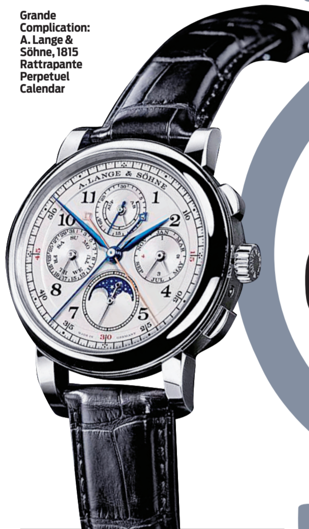
Grande Complication: A. Lange & Söhne, 1815 Rattrapante Perpetuel Calendar

Right in the centre of the city, on the topmost floor of the Palladium Hotel, Mumbai is its spa. Now you might think the hustle of the city would affect the peace but once you're safely shut in the plush spa room, serenity sets in. While the spa boasts an array of calming, rejuvenating, relaxing and energising therapies, which indeed are worth trying out, you might want to relax under its special spell of facials on offer. Like The Morning Mist refresher, a replenishing facial, or the Renewal Facial, which works on exfoliation with a Rainforest Mixture. And if you're looking for a decongesting treatment, opt for the Aqua Floral facial which contains marine extracts. Once you're on the table, expert hands ensure that you're carried away to either deep sleep or to a relaxing realm, either of which is much needed to calm those jaded nerves.