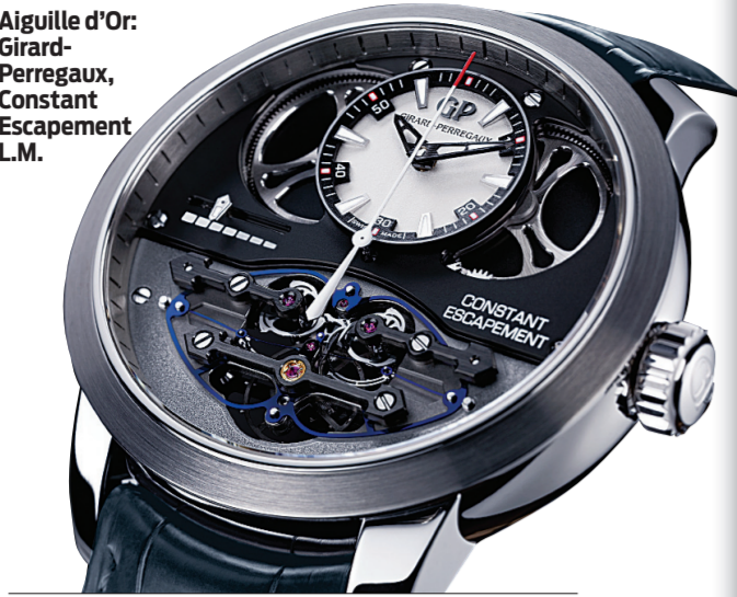
Aiguille d'Or: Girard-Perregaux, Constant Escapement L.M.

Considered as the Oscars of watchmaking, the Grand Prix d'Horlogerie de Genève 2013 recently concluded with 15 prizes awarded to an array of timepieces. Here's an excerpt of the prizes