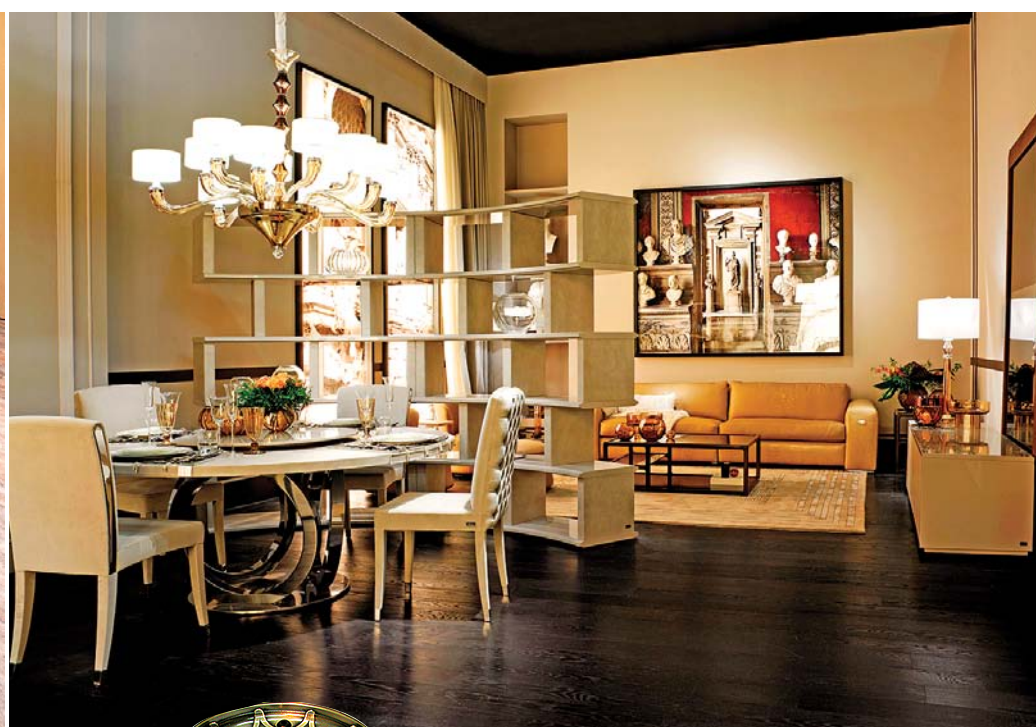
THE BIG DOOR