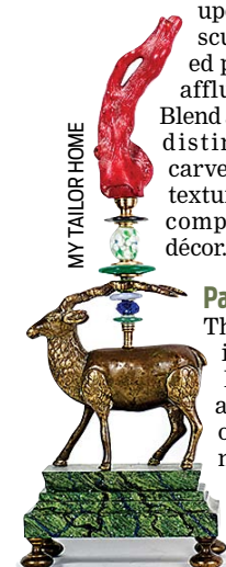
MY TAILOR HOME

The character of any space is defined by its colour. Rich metallics like gold and silver are the essence of superfluity. Gilded cabinets and furniture with metallic leafing add a deluxe feel. "A silver or me-